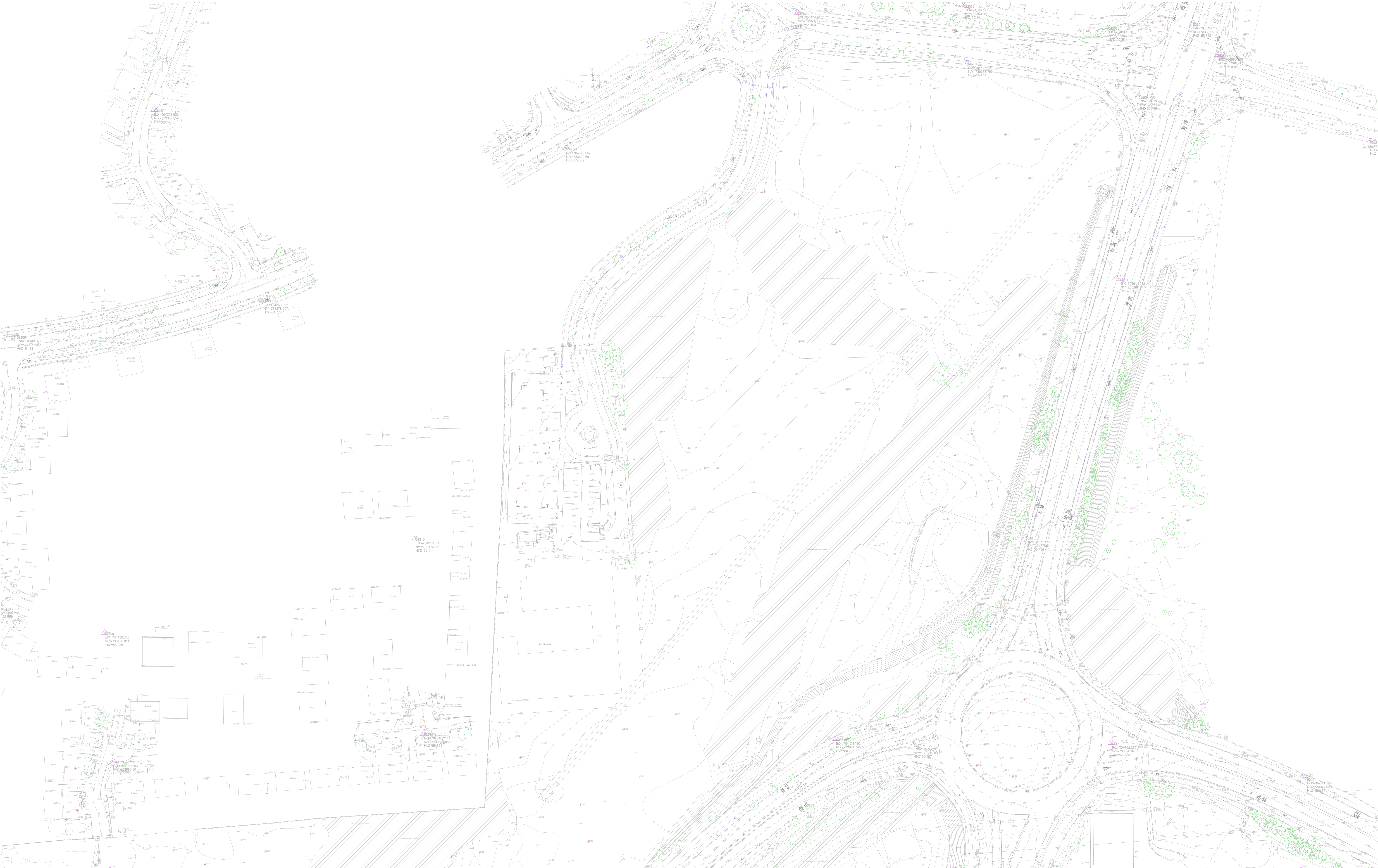
Existing Site Survey Plan 5 of 6